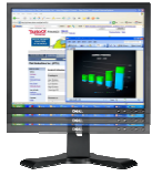
1) Height Adjustment