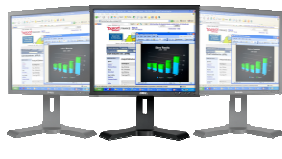
2) Swivel (45° Left and Right)